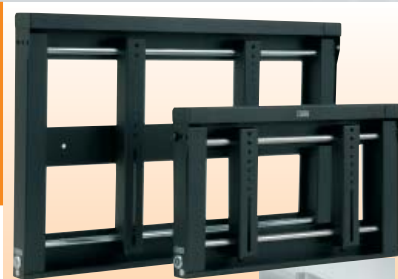
T-T 485-Y02 & T-T 485-Y01

The mounting bracket forms two sections - an external mounting frame that attaches to the wall and an internal frame that is first attached to the flat panel screen. The supports on the internal frame are adjustable to fit most Plasma and LCD screens. When the interior frame is combined with the exterior mounting frame the screen is secured with two hardened, anti-drill security locks. This specially developed flat panel mount maximises security and minimises the threat of theft.