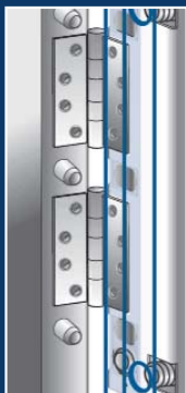
Hinge Chassis System